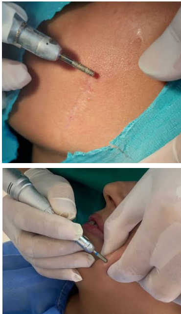
Fig. (3). Dermabrasion with saline cooling on both scars.