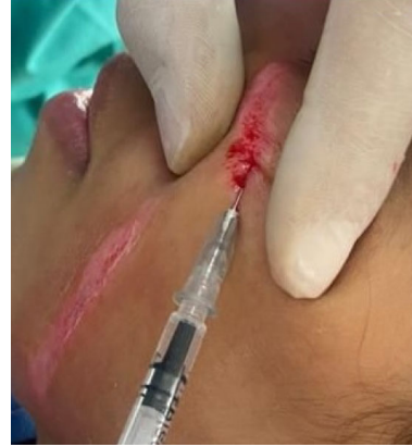
Fig. (5). Hyaluronic acid injections into the dermis.