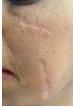
Fig. (2). Two atrophic scars on the cheek and under the left eye.