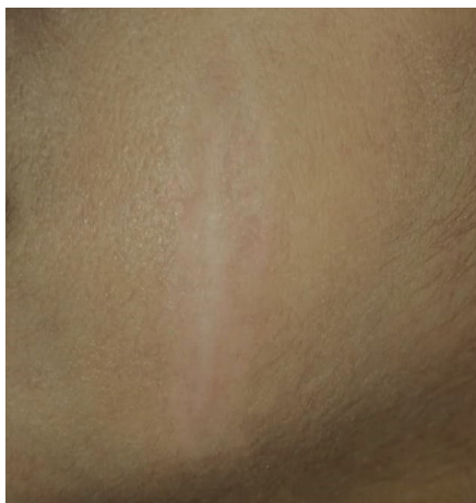
Fig. (7). Follow up after 6 months (dermabrasion without hyaluronic acid injections).

The Patient and Observer Scar Assessment Scale (POSAS) comprises two parts: a patient-specific scale and an observer-specific scale, each with 6 items. In both scales, every item is rated on a scale of 1 to 10, with 10 representing the most severe scar characteristics and 1 indicating healthy skin (normal pigmentation, absence of itching, etc.). The overall score for both the patient-specific and observer-specific scales was obtained by summing the scores for all six items, resulting in a total score between 6 and 60. To simplify interpretation, the total score was then divided by 6 to yield a final index score ranging from 1 to 10. The summed total represents the comprehensive score for the Scar Status Assessment Scale for both the patient and the observer.