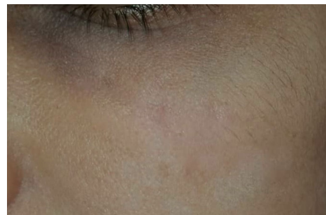
Fig. (6). Follow up after 6 months (dermabrasion with hyaluronic acid injections).

The scars were assessed using the Patient and Observer Scar Assessment Scale (POSAS). An evaluation was carried out by both the patient and three external observers from the residents of the department of Oral and Maxillofacial Surgery at Tishreen University Hospital. The observers were unbiased in the patients' assessment, as they were unaware of the treatment method employed. Follow-ups were scheduled at 10-day, 1-month, and 6-month intervals post-intervention to monitor progress over time (Figs. 6-7).