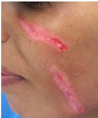
Fig. (4). The treated scar right after the dermabrasion displays punctate bleeding, which indicates the necessary depth of dermabrasion.