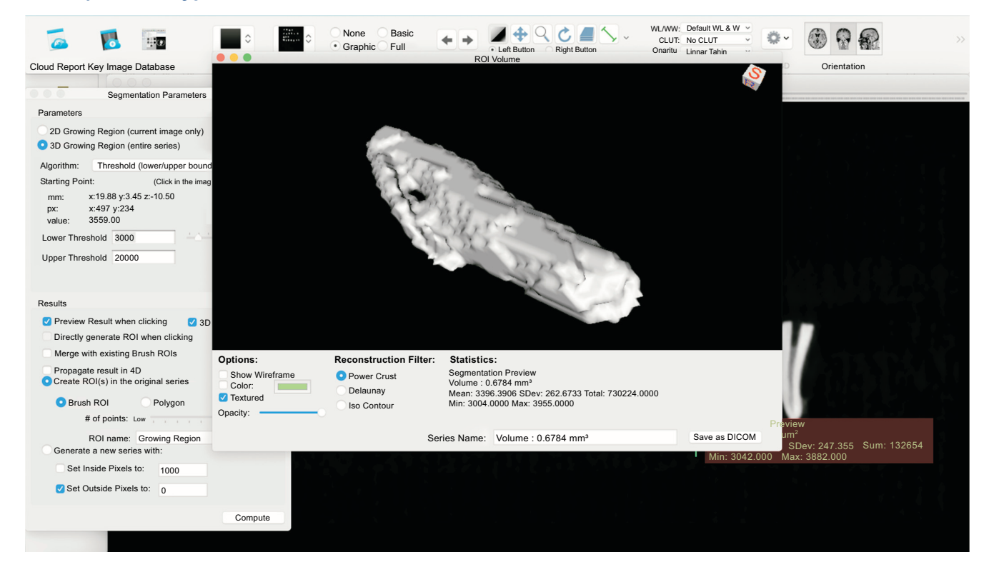
Fig. (2). Segmented part of root filling material BioRoot RCS.

The highest density value for dentin measured in the study was2810, while the lowest density value for root canal filling material was3004. By setting parameters with a lower limit of 3000 and an upper limit of 20000, we successfully segmented only the root canal filling material, excluding dental structures from the measurement.